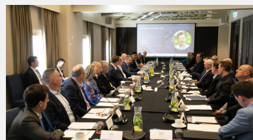
BCCM CEO Roundtable, NME Launch and Resilience Dinner 19 June 2025, Sydney