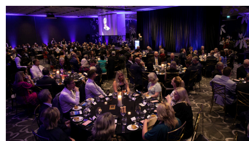
IYC2025 Leaders' Summit and Taste of Australia Dinner 23 and 24 October 2025, Adelaide