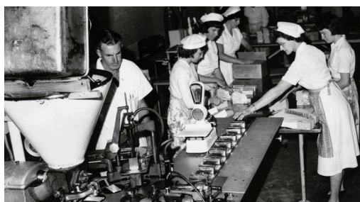
365 days of co-operation Daily social media campaign, prepared by the BCCM with member and sector contributions