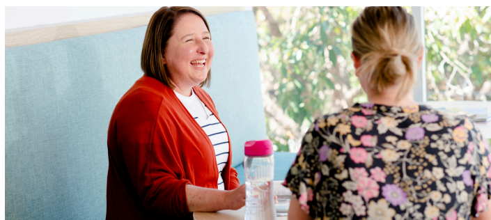
Kudos Services

Housing co-operatives and the mutual financial sector can be boosted to provide more secure, affordable housing – particularly for key workers priced out of the housing market.