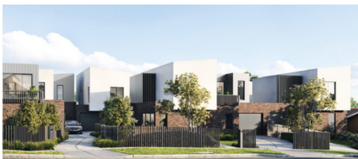
CEHL member co-op property

As we move towards a greener economy and climate resilience, energy co-operatives can help to embed local ownership and engagement in the future of energy security.