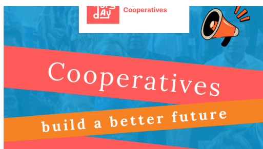
International Day of Cooperatives 5 July 2025