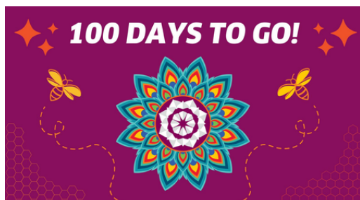
International launch of IYC25 25–30 November 2024 New Delhi, India