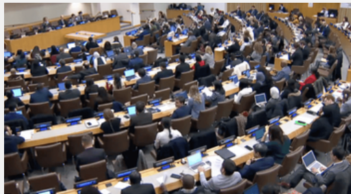
Soft launch of IYC2025 9 July 2024 United Nations, New York