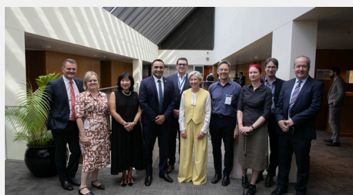
Parliamentary Friends Icons Breakfast Series May – Brisbane, Hobart, Melbourne July – Perth,