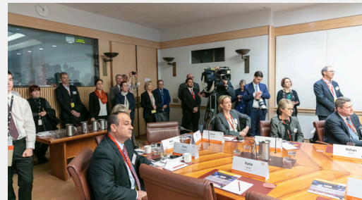
Soft National launch of IYC2025 and Parliamentary Friends (Federal) 21 November 2024, Canberra