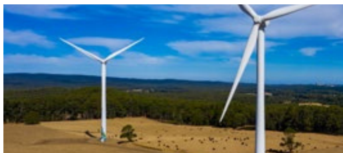
Hepburn Energy

The co-operative sector can contribute even more to economic growth by boosting advanced manufacturing, creating jobs and driving our export capability.