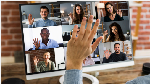
IYC2025 Steering Group consultation webinars 30 September 2024