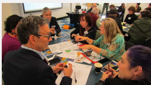
Co-op Fed Assembly March 2025, Sydney