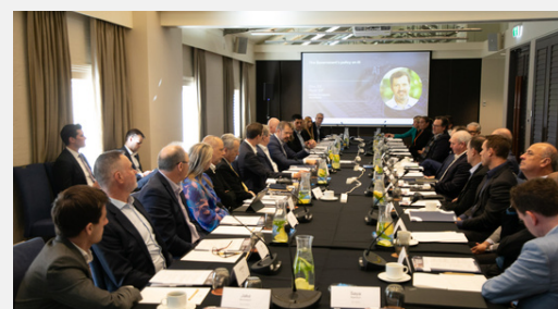
BCCM CEO Roundtable, NME Launch and Resilience Dinner 19 June 2025, Sydney