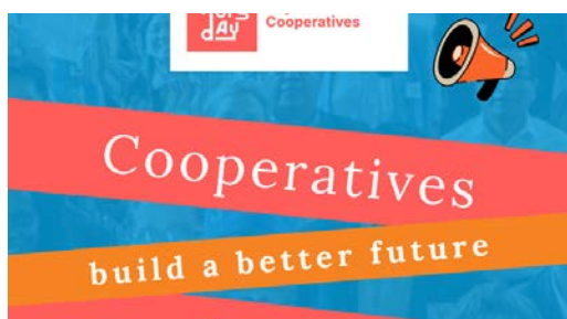
International Day of Cooperatives 5 July 2025