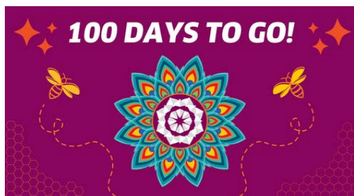
International launch of IYC25 25–30 November 2024 New Delhi, India