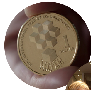
IYC2012 Australian coin

International Year of Cooperatives 2025 is a chance to highlight the significant socio-economic contributions of co-operatives, particularly their roles in poverty reduction, job creation and social integration.