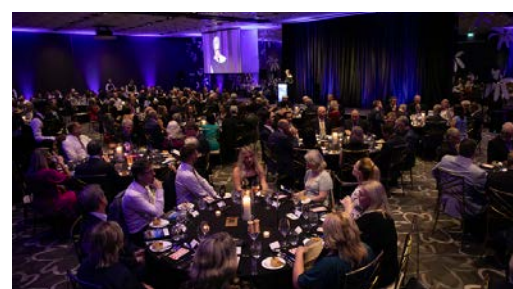
IYC2025 Leaders' Summit and Taste of Australia Dinner 23 and 24 October 2025, Adelaide