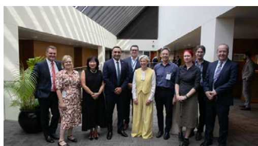
Parliamentary Friends Icons Breakfast Series TBC