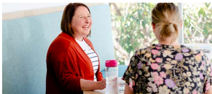
Kudos Services

Housing co-operatives and the mutual financial sector can be boosted to provide more secure, affordable housing – particularly for key workers priced out of the housing market.