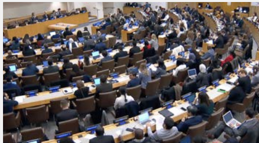
Soft launch of IYC2025 9 July 2024 United Nations, New York