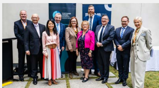
National launch of IYC2025 February 2025 (TBC), Canberra