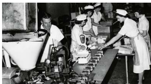
365 days of co-operation Daily social media campaign, prepared by the BCCM with member and sector contributions