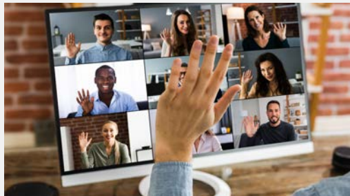
IYC2025 Steering Group consultation webinars 30 September 2024