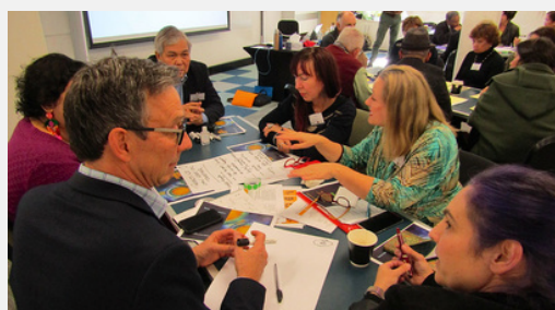
Co-op Fed Assembly March 2025, Sydney