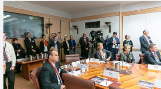
Soft National launch of IYC2025 and Parliamentary Friends (Federal) 21 November 2024, Canberra