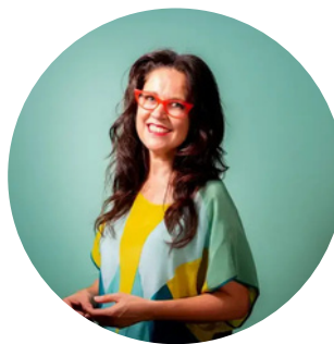
Annabel Crabb Author and Journalist