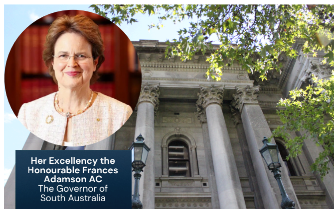
Her Excellency the Honourable Frances Adamson AC The Governor of South Australia

Start your Summit experience at Government House with Breakfast on the Hill – a high-profile event celebrating the vital role of co-operatives and mutuals in South Australia's economy and communities. Proudly hosted by Beyond Bank, it's a key opportunity to connect with community leaders and highlight the sector's impact and potential.